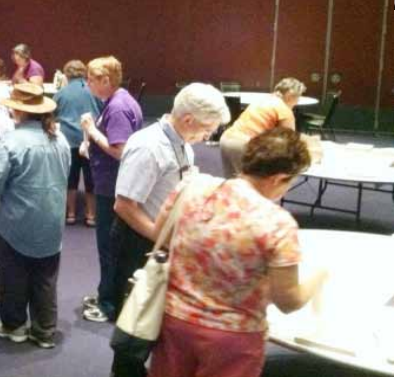
LWML National Convention: Volunteers producing the Spanish book of Revelation. Volunteers collating the book of Revelation with My Lord"