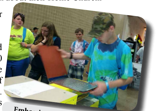
Embossing John 3:16