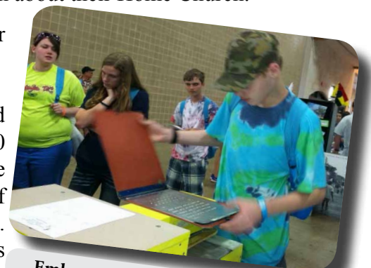
Embossing John 3:16