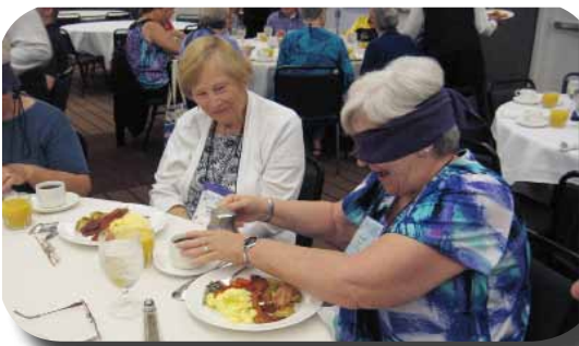
Volunteers experiencing eating their breakfast as if they were blind.

Thirty Spanish Braille books were assembled for South America. There were several Work Center volunteers that helped with quality control, but there were many first-timers that wanted to experience what it was like to make something that will be sent to “help people touch the promises of Jesus.” There was a new appreciation for the zinc plates that are needed for this production and an awareness of how their Mite money purchased the new plate embossing device.