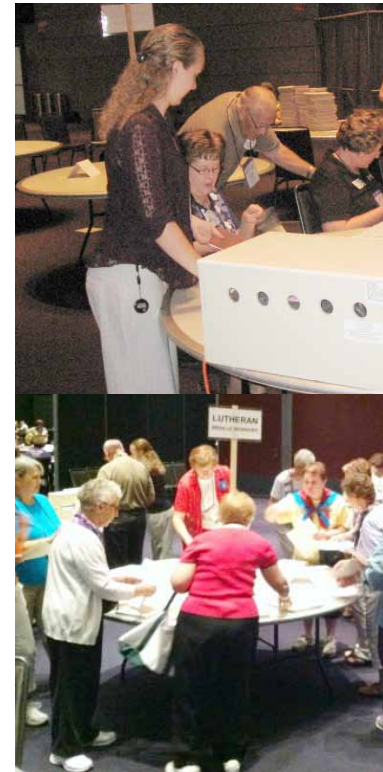
“Servant Event” at the LWML Convention. Top picture are of LWML Volunteers. The bottom picture are of “Walking With My Lord” books.

On Saturday morning LBW hosted a breakfast for the WC volunteers that attended the convention. Seventy people attended and some met the challenge of wearing a blindfold while they ate. Hopefully there will be more LWML groups that will sponsor a “Dining In the Dark” event in their communities as a fund-raiser for LBW.