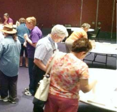
LWML National Convention: Volunteers producing the Spanish book of Revelation in Braille. "We are grateful for the volunteers collating the book of Revelation in Braille with My Lord"