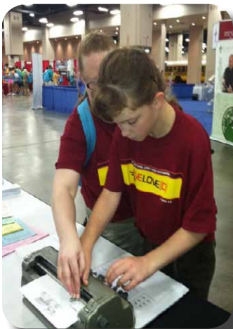
1st time Attendee of the Youth Gathering was excited to show her sister & staff her Braille Skills.