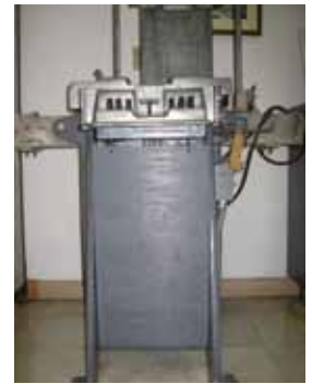
1955: Transcribers begin using the Stereotype