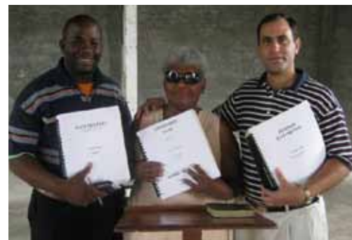
Braille recipients in Cuba