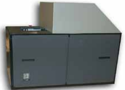
Newly purchased Plate Embossing Device (PED) to be delivered May 2012

If you would like to become part of the "Quiet Drive" and are willing to dedicate your time to learn Braille, contact the home office for more information on the Braille course.