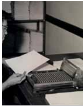
1950's: Transcriber operating a Flatbed Press