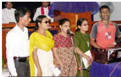
Braille recipients in India